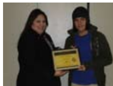
Grand Opening Invitation Creation & Design - Rey Arevalo