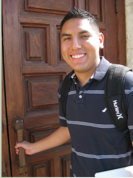
Alamo Teen Scene 13-17 years