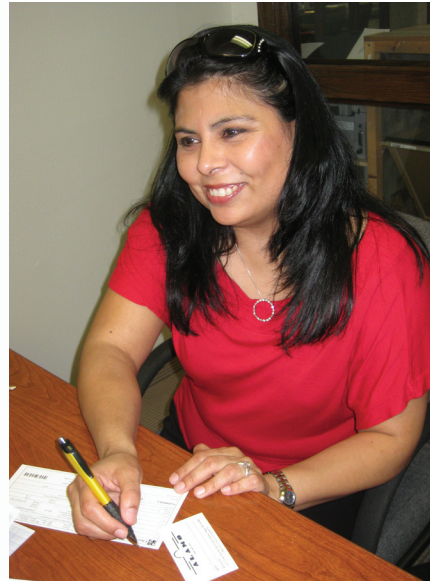
Alamo Direct Express 18-49 years